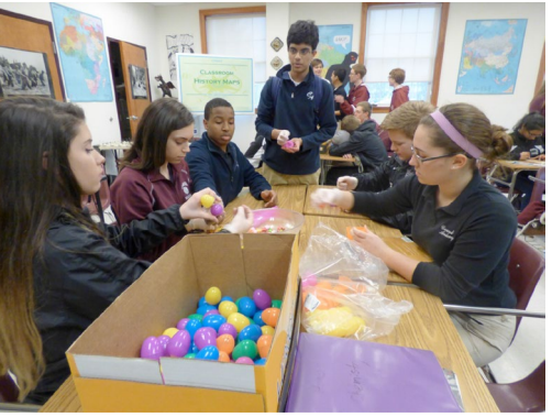
CSG Executive Committee prepares for the EEC and Lower School Easter Egg Hunt.

the EEC and Lower School. During the CSG's weekly Wednesday meetings leading up to the egg hunt, the executive committee filled Easter eggs with candy and decorated Easter bags for the