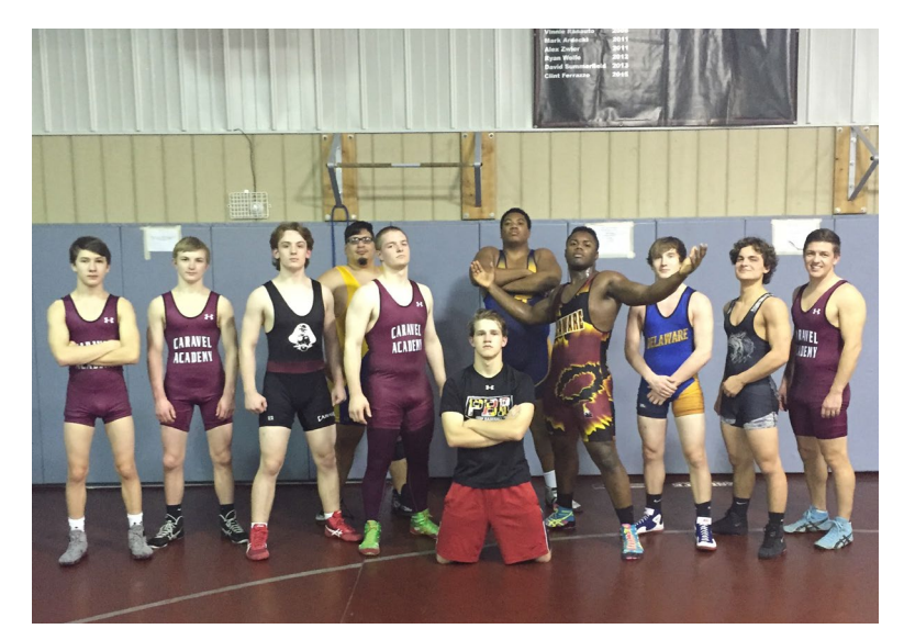
Varsity Wrestling team is ready to compete.